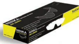
BL-PSLNINKP01 Ninka Clear Lens Refill Pack of 20