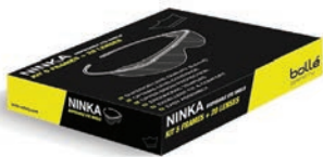
BL-PSONINS010 Ninka Mini Kit 5 Grey Frames and 20 Clear Lens